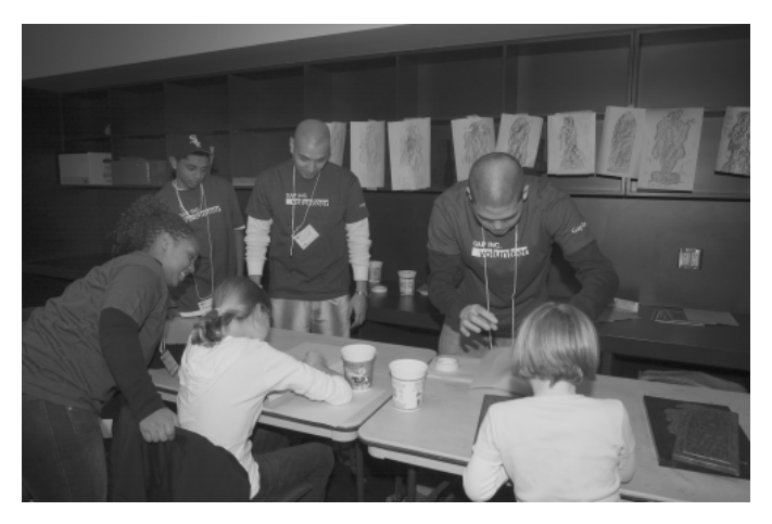
During March Break, kids enjoyed special activites throughout the Museum.