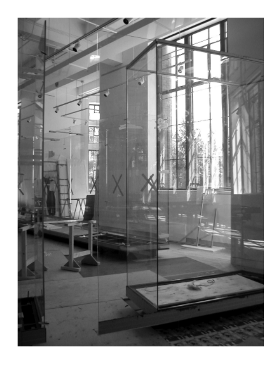
Display case assembly in the light filled renovated Philosophers' Walk wing of the Museum.

Through the winter, the waterproof cladding of the Michael Lee-Chin Crystal became more prominent along the Bloor Street façade, renewing public interest in the progress of construction and the final appearance of the building. Fireproofing of the structural steel, the installation of sub-floors and mechanical/ electrical work progressed. Other work accelerated indoors in some areas, particularly in the future Garfield Weston Exhibition Hall , immediately below the lobby.