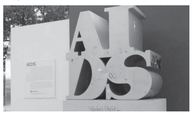
AIDS, 1989 General Idea lacquered metal

View of General Idea's AIDS sculpture displayed outside the ROM at the corner of Bloor St. West and Queen's Park.