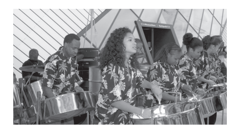
The ROM's Bloor Street Plaza was filled with the sounds of the Caribbean by Pan Fantasy Steel Band during Scotiabank Caribana, July 2008.