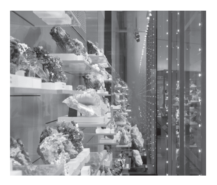
The Teck Suite of Galleries: Earth's Treasures showcases the Royal Ontario Museum's exceptional specimens of minerals, gems, rocks and meteorites, a collection among the finest in North America.

Over 2,300 specimens of minerals, rocks, meteorites and gems.